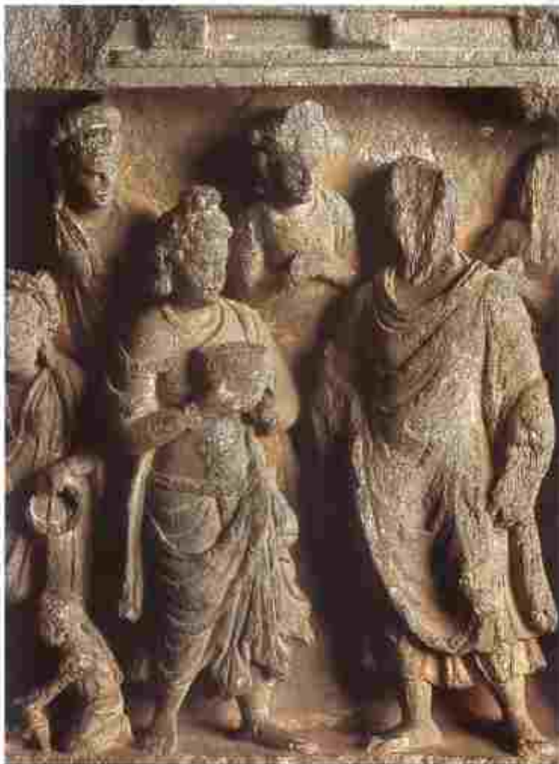
Fig. 3.6 Depiction of a mendicant seeking alms, stone sculpture (Gandhara) c. third century, CE

By examining non-Brahmanical texts which depict the lives of chandalas , historians have tried to find out whether chandalas accepted the life of degradation prescribed in the Shastras . Sometimes, these depictions correspond with those in the Brahmanical texts. But occasionally, there are hints of different social realities.