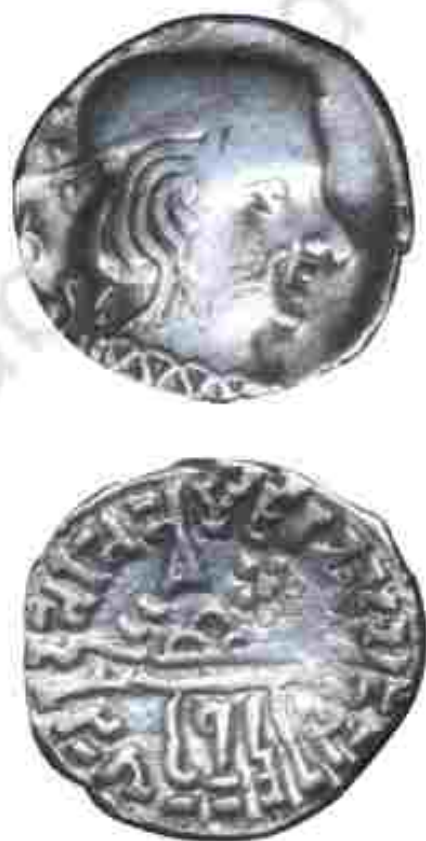
Fig. 3.5 Silver coin depicting a Shaka ruler, c. fourth century CE

We seldom come across documents that record the histories of these groups. But there are exceptions. One interesting stone inscription (c. fifth century CE), found in Mandasor (Madhya Pradesh), records the history of a guild of silk weavers who originally lived in Lata (Gujarat), from where they