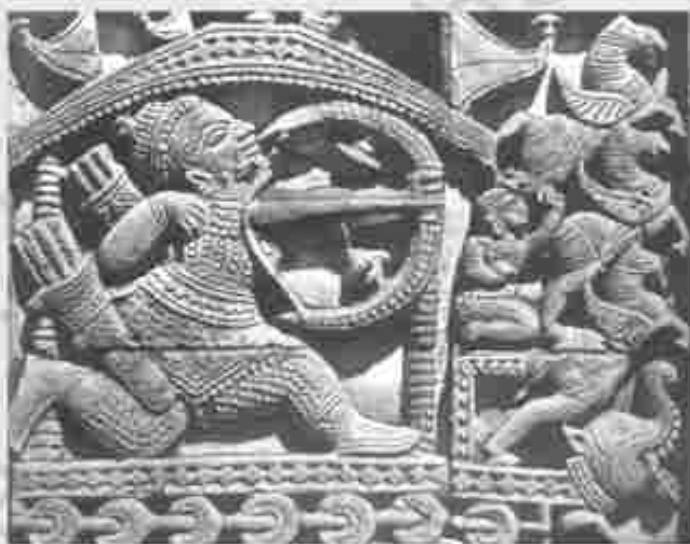
Fig. 3.1 A terracotta sculpture depicting a scene from the Mahabharata (West Bengal), c. seventeenth century

In focusing on the Mahabharata , a colossal epic running in its present form into over 100,000 verses with depictions of a wide range of social categories and situations, we draw on one of the richest texts of the subcontinent. It was composed over a period of about 1,000 years (c. 500 BCE onwards), and some of the stories it contains may have been in circulation even earlier. The central story is about two sets of warring cousins. The text also contains sections laying down norms of behaviour for various social groups. Occasionally (though not always), the principal characters seem to follow these norms. What does conformity with norms and deviations from them signify?