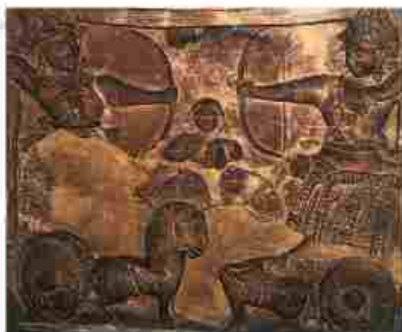
Fig. 3.4 A battle scene

We have seen that Satavahana rulers were identified through metronymics (names derived from that of the mother). Although this may suggest that mothers were important, we need to be cautious before we arrive at any conclusion. In the case of the Satavahanas we know that succession to the throne was generally patrilineal.